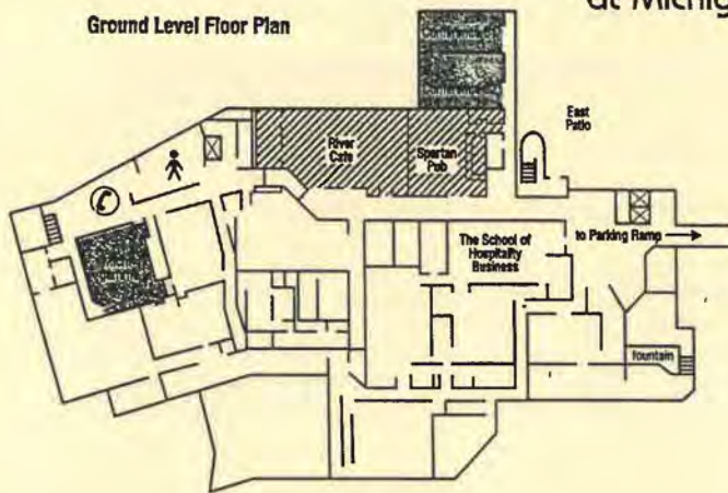
Ground Level Floor Plan